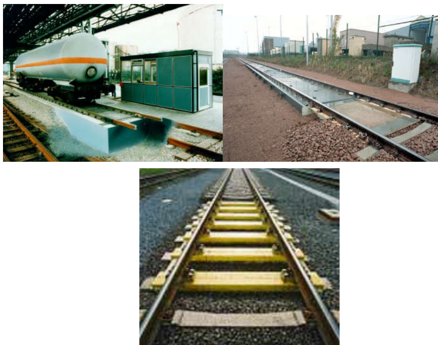
Fig. 2. The platform scales (top left), in the foundation tank (top right) and in the rail beams (bottom) Rys. 2. Wagi kolejowe pomostowe (u góry z lewej), w wannie fundamentowej (u góry z prawej) i w podkładach kolejowych (u dołu)

Initially, in the road transport there were only bridge structures where extensometers or light pipe detectors were used for measurement. They are mounted inside the bridge structure during its construction or they are installed outside [Chatterjee P. and others 2006, Karoumi R. and others 2005]. Examples of such a type of measuring equipment are rail scales made with the use of prefabricated concrete elements like a platform or a foundation tank (fig. 3). The weighing electronic engineering of rail static scales, dynamic scales and static-dynamic scales consists of extensometers inserted into special elastomer beds as well as control electronics which uses specialist weighing PC software.